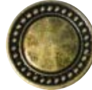
BR2/MT044 Brass Buckle