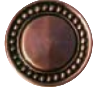
BR2/MT077 Copper Buckle