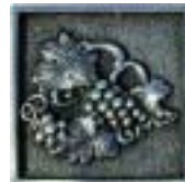
2x2/MT011A Pewter Charm