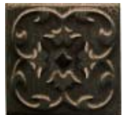
4x4/MT044F Brass Kaleidoscope also available in 4x4/MT011F Pewter Kaleidoscope 4x4/MT077F Copper Kaleidoscope