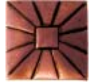
B2x2/MT077 Copper Buckle