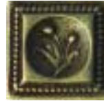
B1x1/MT044 Brass Buckle