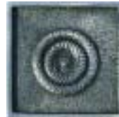
2x2/MT011C Pewter Pendant