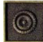
2x2/MT044C Brass Pendant