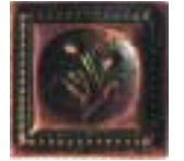
B1x1/MT077 Copper Buckle