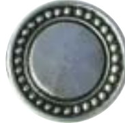
BR2/MT011 Pewter Buckle