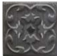
4x4/MT011F Pewter Kaleidoscope also available in 4x4/MT044F Brass Kaleidoscope 4x4/MT077F Copper Kaleidoscope