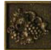
2x2/MT044A Brass Charm