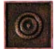
2x2/MT077C Copper Pendant