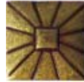
B2x2/MT044 Brass Buckle