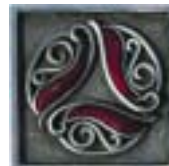
2x2/MT011B Pewter Filigree