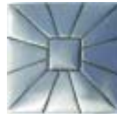
B2x2/MT011 Pewter Buckle