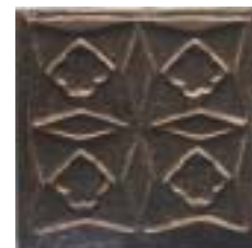
4x4/MT077E Copper Emblem also available in 4x4/MT011E Pewter Emblem 4x4/MT044E Brass Emblem