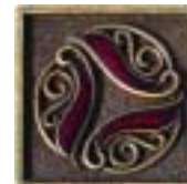
2x2/MT044B Brass Filigree