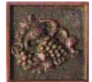
2x2/MT077A Copper Charm