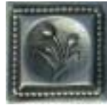
B1x1/MT011 Pewter Buckle