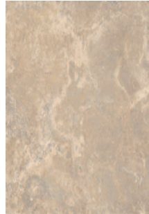
23136 Sand Taupe