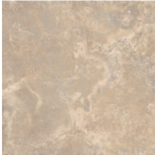
23136P Sand Taupe