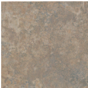
23194P Russet Brown