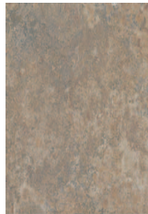
23194 Russet Brown