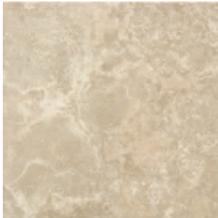
23126P Pebble Beige