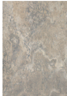
23115 Rock Gray