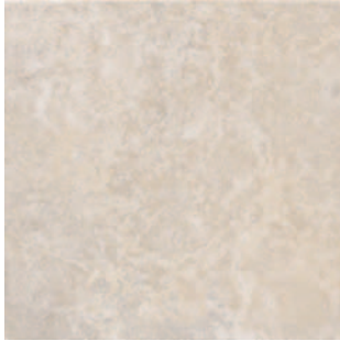
23102P Stone White