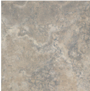
23115P Rock Gray