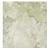
Verde 6140AP 12x12 6142AP 18x18