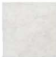
Ivory Blend 8140AP 12x12 8142AP 18x18