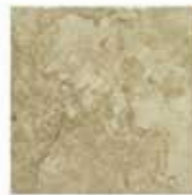
Warm Walnut 7140AP 12x12 7142AP 18x18