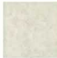
Avorio 5140AP 12x12 5142AP 18x18